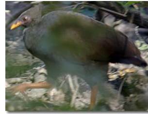
Dusky Megapode or Dusky Scrubfowl, Megapodius freycinet